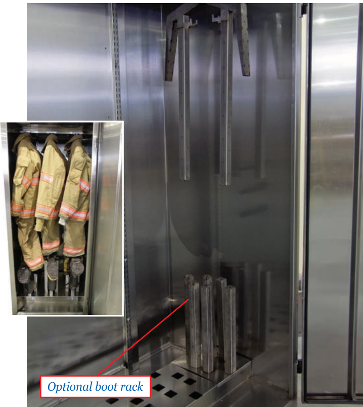
Optional boot rack

Insertion air tubes allow heated airflow to penetrate into the hanging jackets and bibs, providing superior drying performance. An optional boot rack can be inserted as tubes into the bib leg to increase directed airflow into the gear and speed drying time.