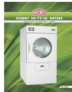
EcoDry 30-75 lb. Dryers

For more information, visit www.milnor.com/brochures