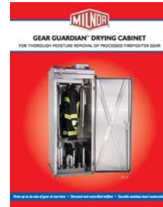
Gear Guardian™ Drying Cabinet