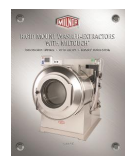
Rigid Mount with MilTouch™ control