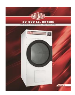
M30-200 lb Dryers