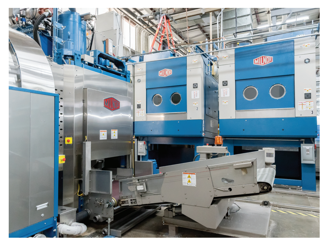
ABOVE: A view of Wesport Linen Services' recently refurbished wash aisle in Baton Rouge, including a new CBW and 50 bar press that's helped this healthcare operator increase throughput, while cutting water consumption from 1.65 gal per lb. to 0.8 gal/lb.