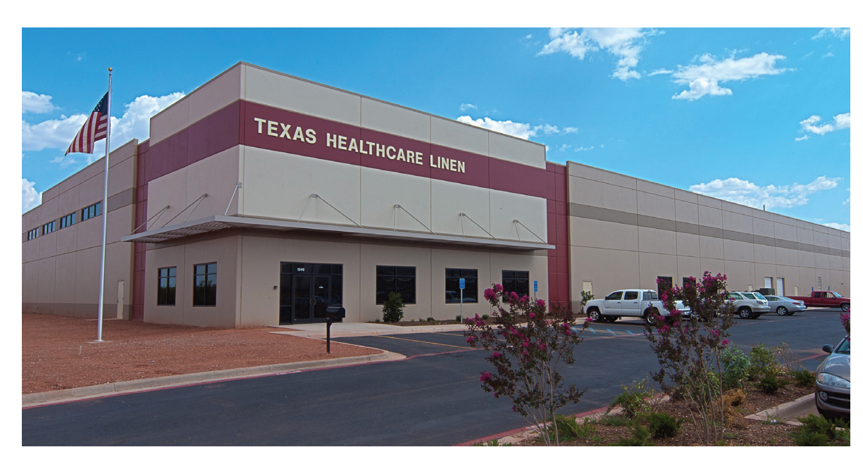
ABOVE: Laundry managers at Texas Healthcare Linen, a hospital-owned central laundry in Abilene, TX, said they wanted a "state-of-the-art facility." To realize their goal of efficient, high-quality processing, they chose wash equipment from Pellerin Milnor Corp.