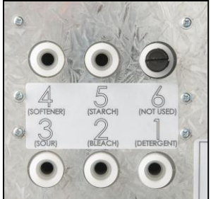
Safe chemical injection