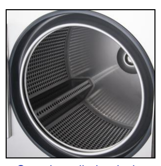
Superior cylinder design