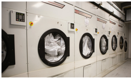
NO CONTEST: Choosing Milnor equipment for Superior Laundry's new facility was a simple decision – especially after salvaging two 86kg (190 lb) Milnor dryers pictured second and third from the right.