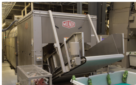
CENTRIFUGAL POWER: Added post-fire, Milnor's centrifugal extractor helps remove excess water from linens in Superior Laundry's new facility.