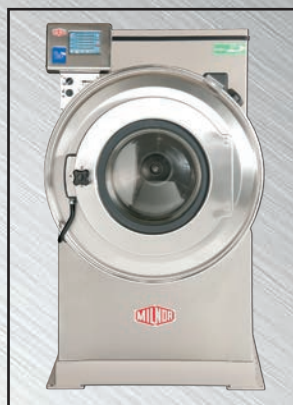
Narrow Footprint: Fits through a 3'-0" doorway