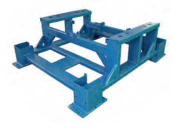
Milnor's MWF-Series suspended washer-extractor frames feature heavy-gauge steel for maximum durability.