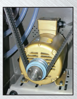
NEMA Premium® efficient inverter-driven motor