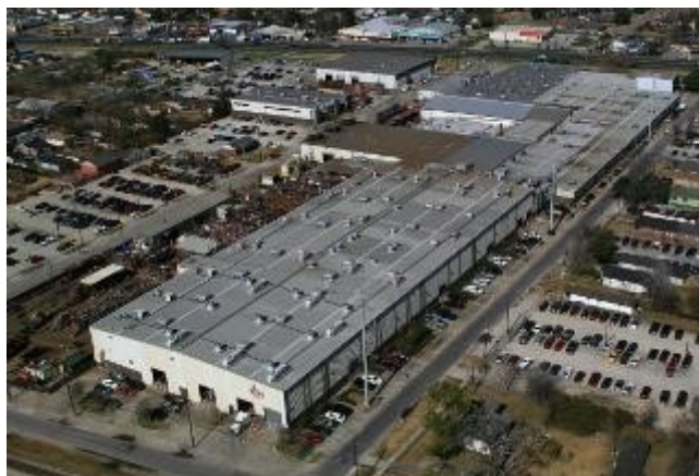
Aerial view of Pellerin Milnor Corp.

For more information, Call: 504-712-7724 Email: service@milnor.com