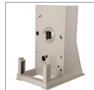
Solid industrial frame

Contact Milnor for your local, authorized dealer: