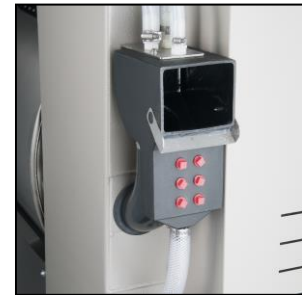
Safe chemical injection