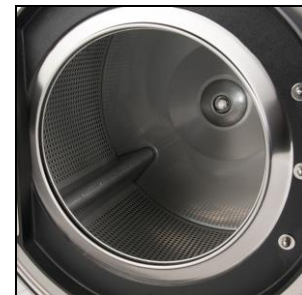
Superior cylinder design