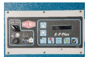
E-P Plus® Control