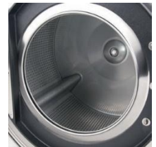
Superior cylinder design

BENEFIT: Faster repairs mean less downtime. Superior product support through local, highly-skilled dealers.