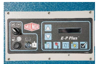
E-P Plus® Control