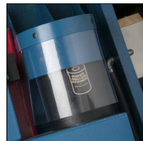
SmoothCoil™ suspension minimizes transmission of unwanted vibration