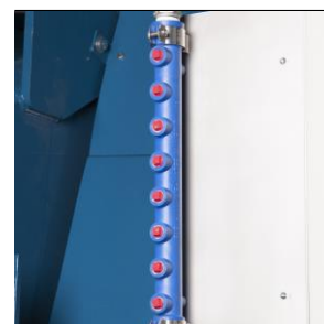
Safe chemical injection