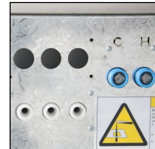
Safe chemical injection