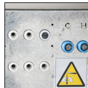
Safe chemical injection