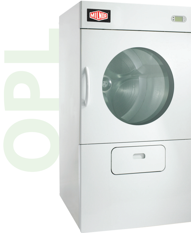
M50ED OPL Dryer

Your local Milnor independent authorized dealer.